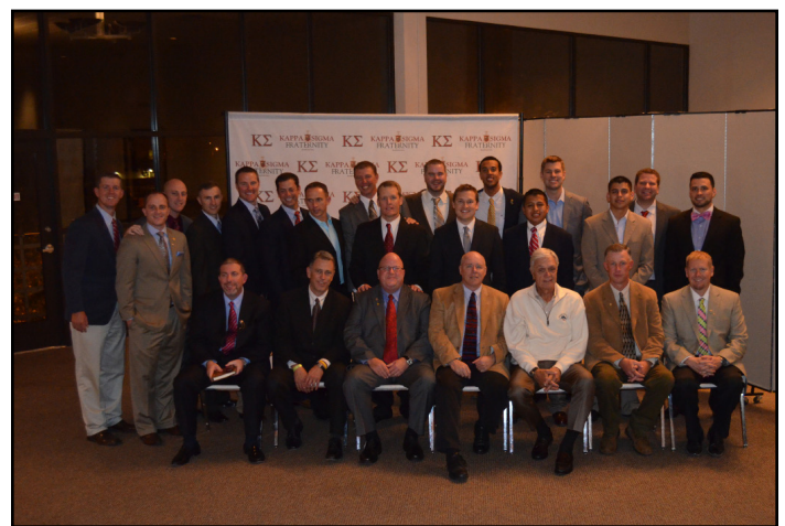
Theta-Zeta Grand Masters Gather at the Chapter's 50th Anniversary Celebration

once in a life time, and we are truly proud of the continued efforts, of Alumni and undergraduates alike, to maintain Theta-Zeta as one of the top chapters in our Fraternity.