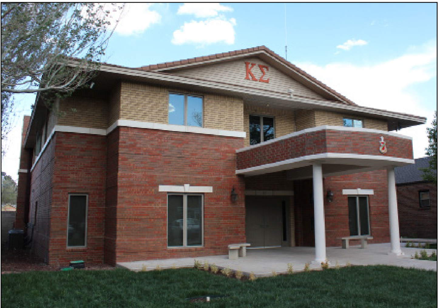
Newly Remodeled Chapter House

The front of the house received a makeover as well with a new covered entry way being added. It now allows for protection from the elements as you enter the chapter house and really creates a grand facade. With the porch and new landscaping the chapter house has tremendous curb appeal. In addition to these items all the HVAC system was replaced and updated, new window treatments were installed, new flooring through out, all new furniture, and four interactive tv's have been put in. This truly makes the Theta-Zeta house number one second to none.