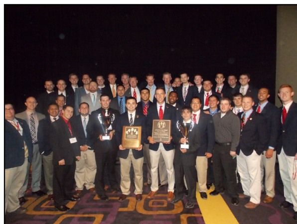
Theta-Zeta with the F.A.C.E. Award, The Founder's Circle, and the Attendance Cup